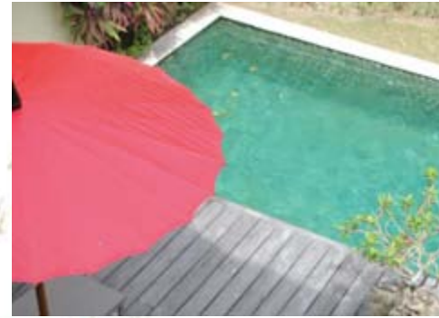
Honeymoon Pool Villas

Secluded within a private walled compound, these tropical hideaways were designed for escapes with loved ones. From the romantic garden pool to the Plantation-style bedrooms, these are the ideal venues for friends to reunite and relax.