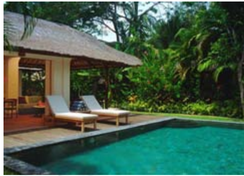
Two-Bedroom Pool Villas

Escape to a blissful world designed for intimacy and romance. With 120sqm of Balinese-flavored interiors and a lush walled garden, couples can relax by their private pool, dine under the stars and create memories to treasure.